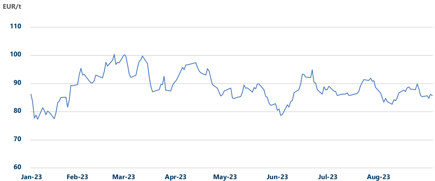
EU Allowances Price Trend in 2023

In August 2023, the EUA futures DEC23 contract exhibited price fluctuations, commencing the month at €85.1 per ton and reaching an intra-month peak of €89.87 per ton on August 22. However, by the end of the month, these prices had retraced to €85.76 per ton, as reported by EEX.